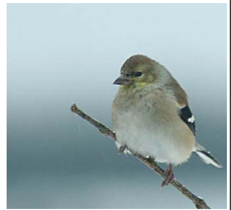
Goldfinch in it's winter "color"

$31.99 Mesh Nyjer Feeder Reg. $34.99 Finch can "cling" and eat!