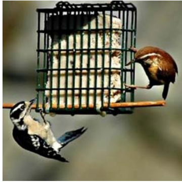
Downy Woodpecker and Carolina Wren

Suet is devoured by Downy Woodpeckers, Hairy Woodpeckers, Red-Bellied Woodpeckers, Carolina Wrens, Chickadees, Nuthatches, Mockingbirds and much more!